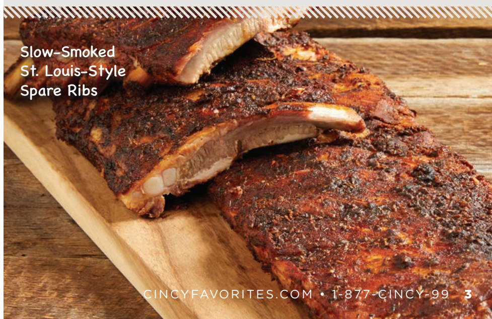
Slow-Smoked St. Louis-Style Spare Ribs

Our smoked spare ribs are also cooked low and slow, but they are sealed in our custom smoker and get just the right amount of hickory wood smoke along with just the right amount of heat. We only use hardwood hickory, exclusively sourced from a farm in Clermont County, Ohio. We NEVER use wood chips or saw dust. Just the real thing – hardwood hickory coals!