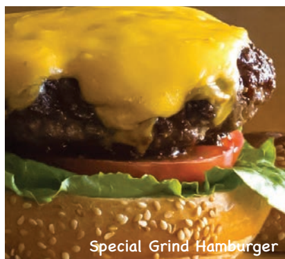
Special Grind Hamburger