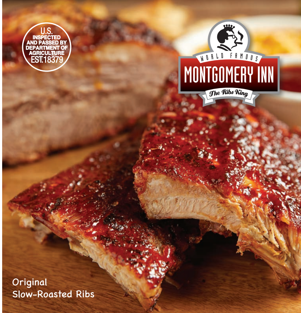
Original Slow-Roasted Ribs