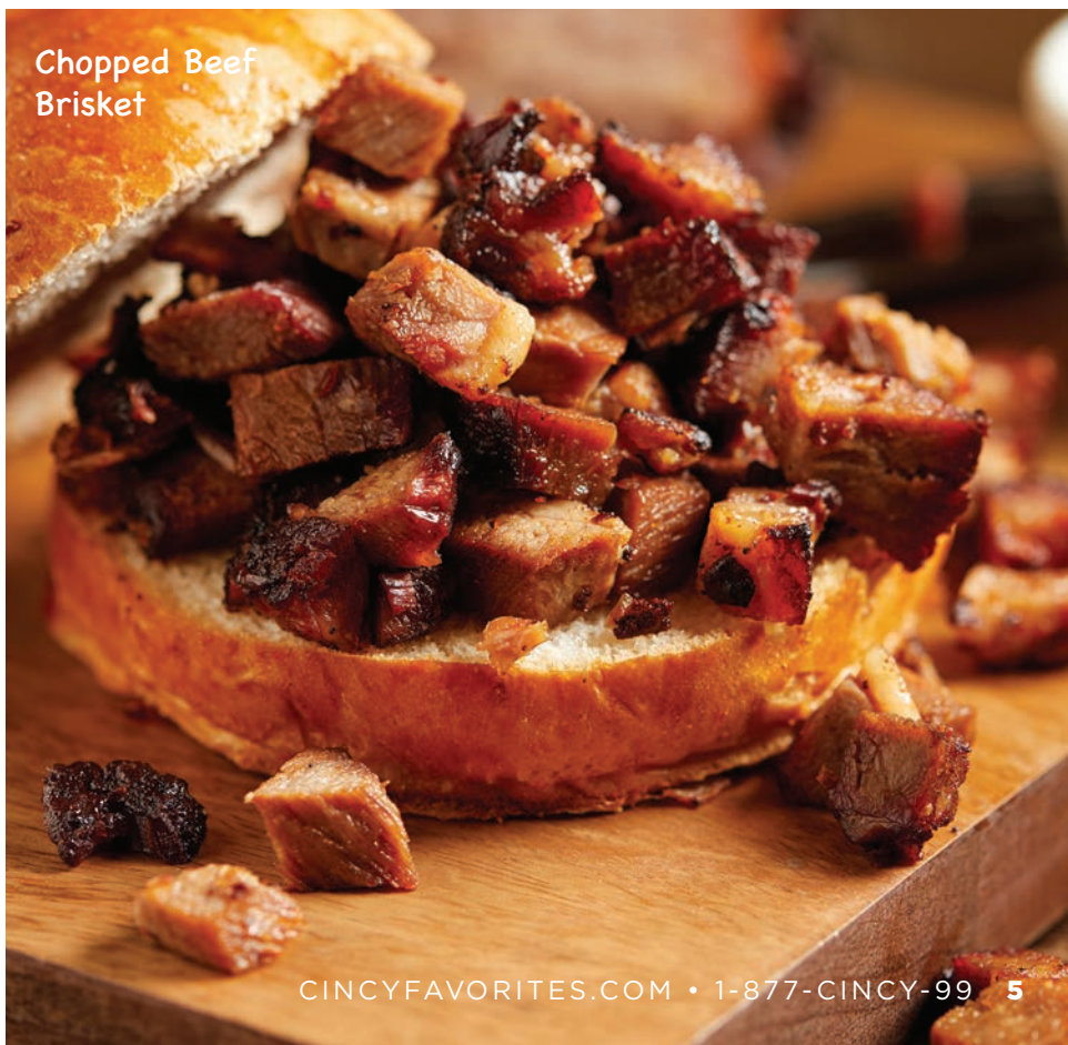
Chopped Beef Brisket