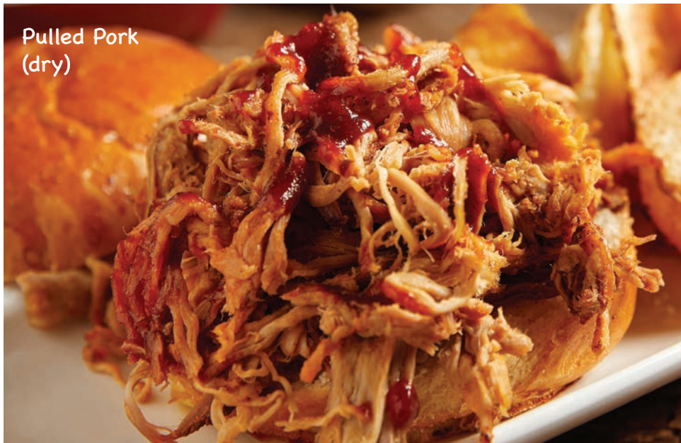
Pulled Pork (dry)