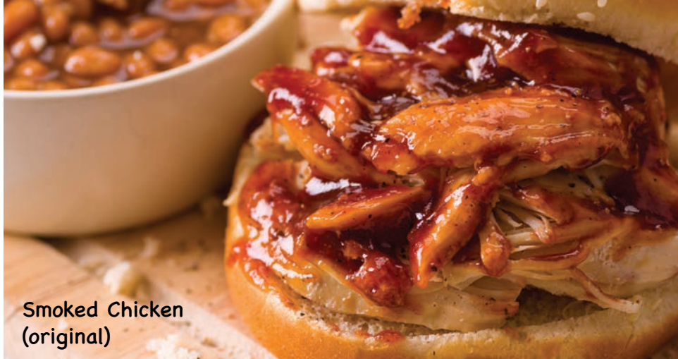
Smoked Chicken (original)